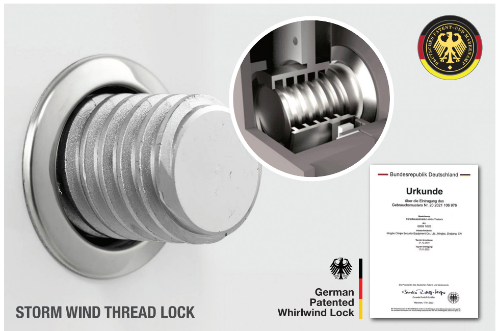
STORM WIND THREAD LOCK