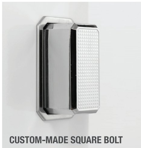
CUSTOM-MADE SQUARE BOLT