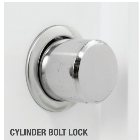
CYLINDER BOLT LOCK